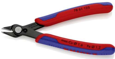
Electronic side cutter small (Tool_004)