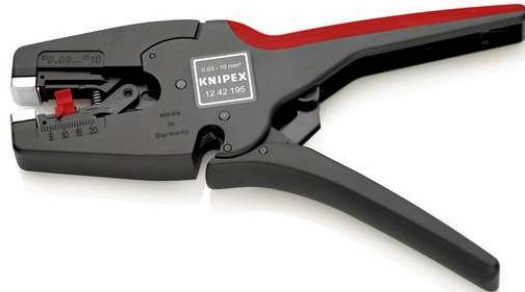
Automatic wire stripper (Tool_003)