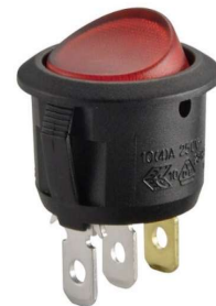
Illuminated rocker switch red 12V (SW0002)