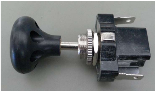
Pull switch (SW0006)