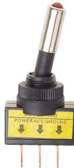
Toggle switch with illuminated lever tip (SW0001)