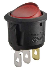
Illuminated rocker switch red 12V (SW0002)