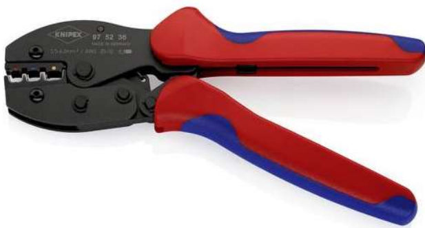
Crimping pliers (Tool_001)