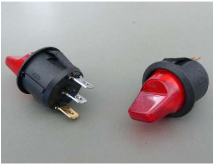
Illuminated toggle switch red 12V (SW0003)