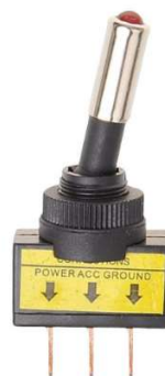
Toggle switch with illuminated lever tip (SW0001)