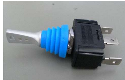
Car toggle switch (SW0007)