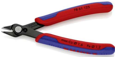
Electronic side cutter small (Tool_004)