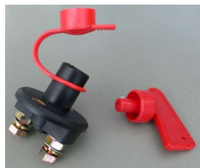
Battery disconnect switch (SW0005)