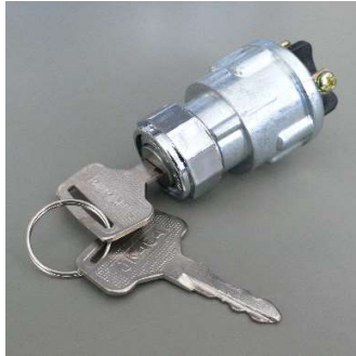
Ignition lock (SW0004)